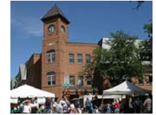
Kennett Square, Chester County

Whether you are currently active within your municipality and interact with local officials or would like to, the SRA will give you the tools, opportunities and information to make a difference.