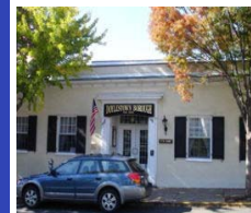
Doylestown, Bucks County Borough Hall

Membership in the SRA Community Liaison Program does not involve a significant time commitment. All we require is a willingness to get involved in the communities that you already care about. Together, we can be a powerful voice for our industry and private property rights.